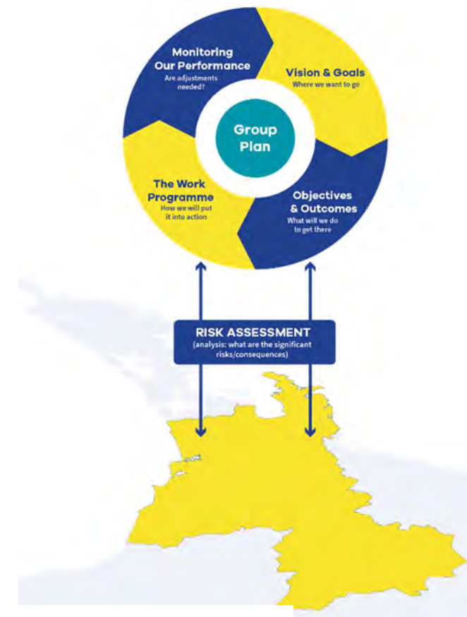
Figure 2: Planning process

The process we use to identify, plan, implement and monitor our strategic direction is outlined in Figure 2. As circumstances evolve, we may need to adjust the plan. These adjustments may be driven by changes in legislation, shifts in our risk profile, evolving public expectations, or the occurrence of significant emergency events.